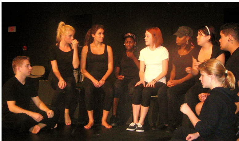
"The Last Supper" – The Godspell Cast