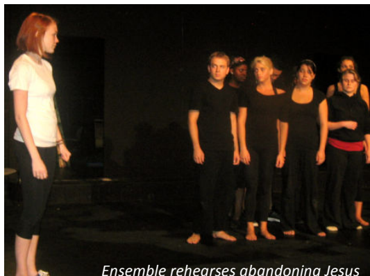
Ensemble rehearses abandoning Jesus

This beautiful story's adaptation is set in none other than the River City, Richmond, VA, allowing its audience to take familiar steps with wits characters throughout each scene and musical number. Not only is this a timeless story of love, hope, and faith set in VCU's backyard, but also pieces—literally pieces—of Richmond are spread throughout the set. Posters, citywide symbols, and even the costumes (some provided by local businesses such as Rumors), allow the feel of the city and emotions brought to life through the diverse array of characters created by the ensemble, who actually play themselves, inhabitants of Richmond.